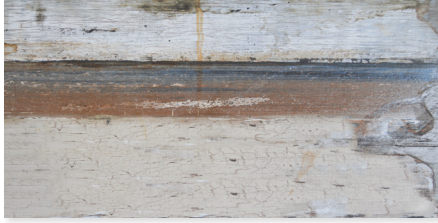
WIS11991 BLOCK Wood Rectified 12"x24" Lappato