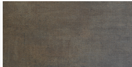
WIS11989 BLOCK Rust Rectified 12"x24" Lappato