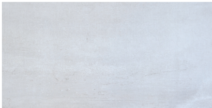
WIS11990 BLOCK White Rectified 12"x24" Lappato