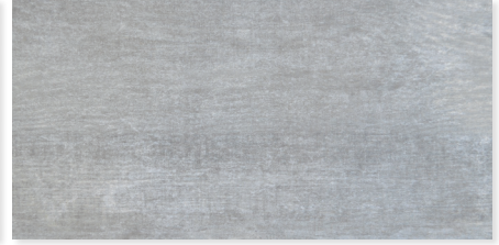
WIS11988 BLOCK Grey Rectified 12"x24" Lappato