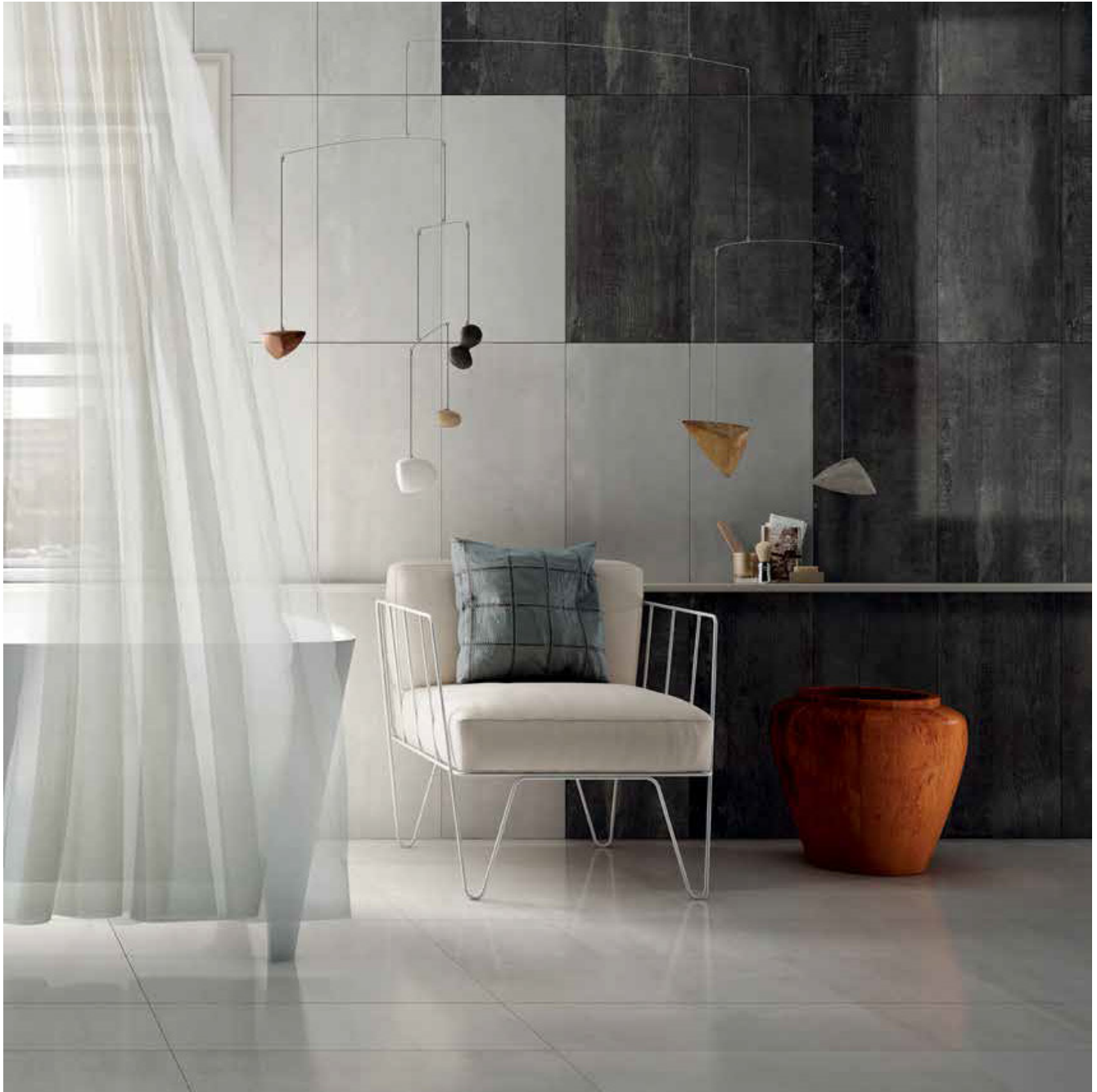
Product Featured: BLOCK White Rectified 12"x24" Lappato - BLOCK Dark Rectified 12"x24" Lappato

The Loft Collection offers five in stock color options with a beautiful lappato finish. This urban chic collection is suitable for wall or floor applications that can be placed in any living quarters. Available in more sizes and finishes through special order.