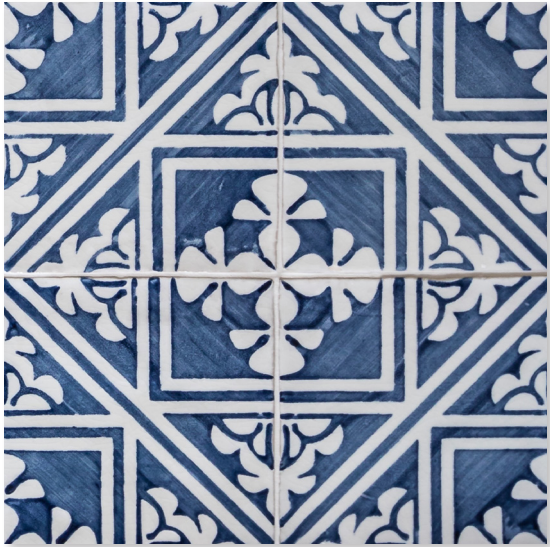
TL91058 manorca crackled 8"x8"x3/8" in stock