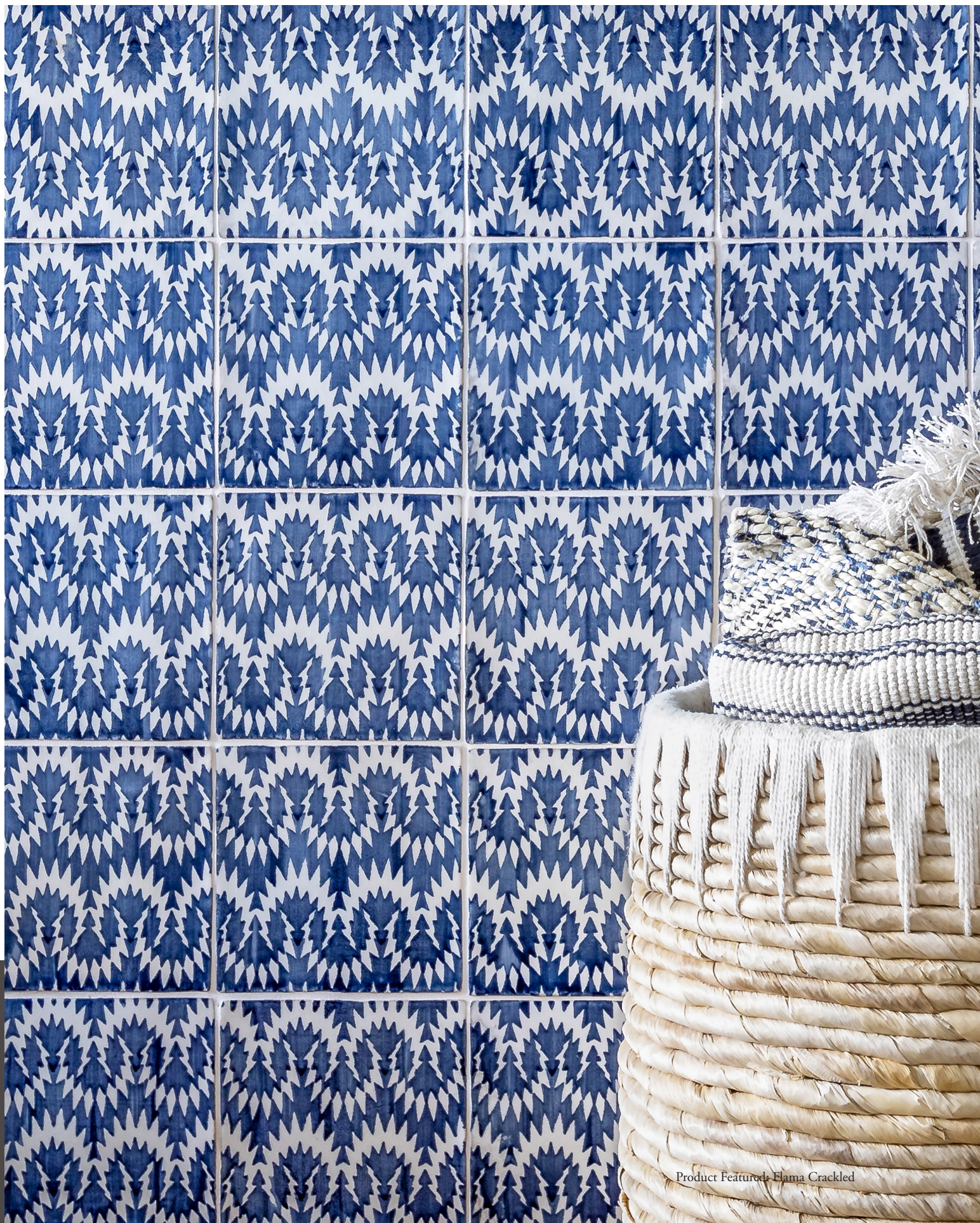
Product Featured: Flama Crackled