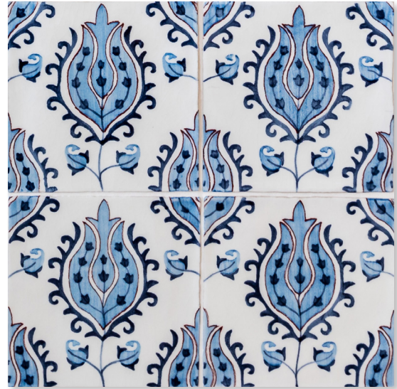
TL91059 tulips crackled 8"x8"x3/8" in stock