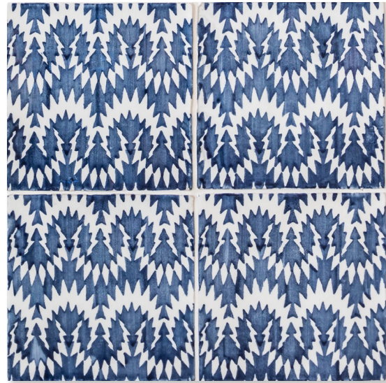
TL91057 flama crackled 8"x8"x3/8" in stock