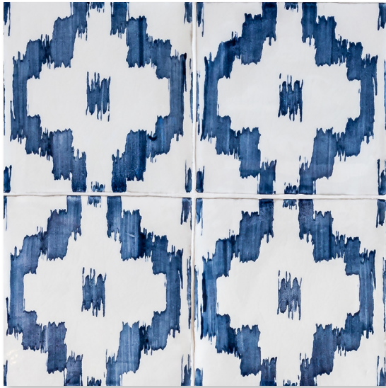
TL91056 ikat crackled 8"x8"x3/8" in stock