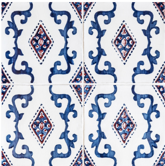
TL91060 india crackled 8"x8"x3/8" in stock