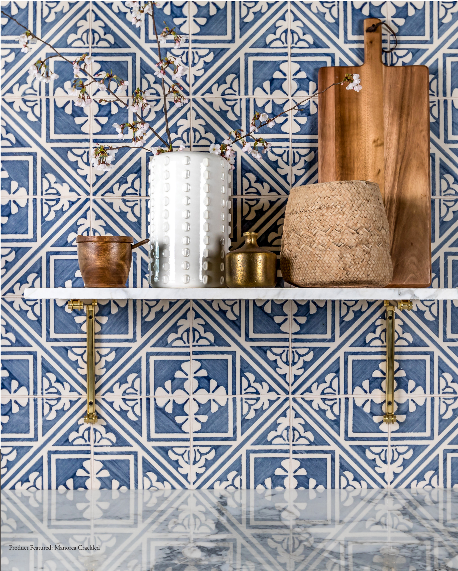
Product Featured: Manorca Crackled