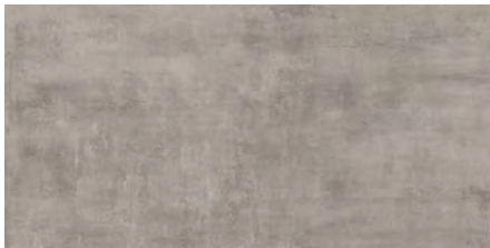
WIS12087 Fog Honed 12"x24"x5/16"