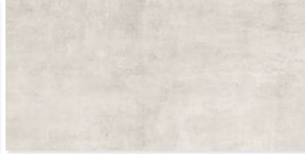
WIS12085 Blanc Honed 12"x24"x5/16"