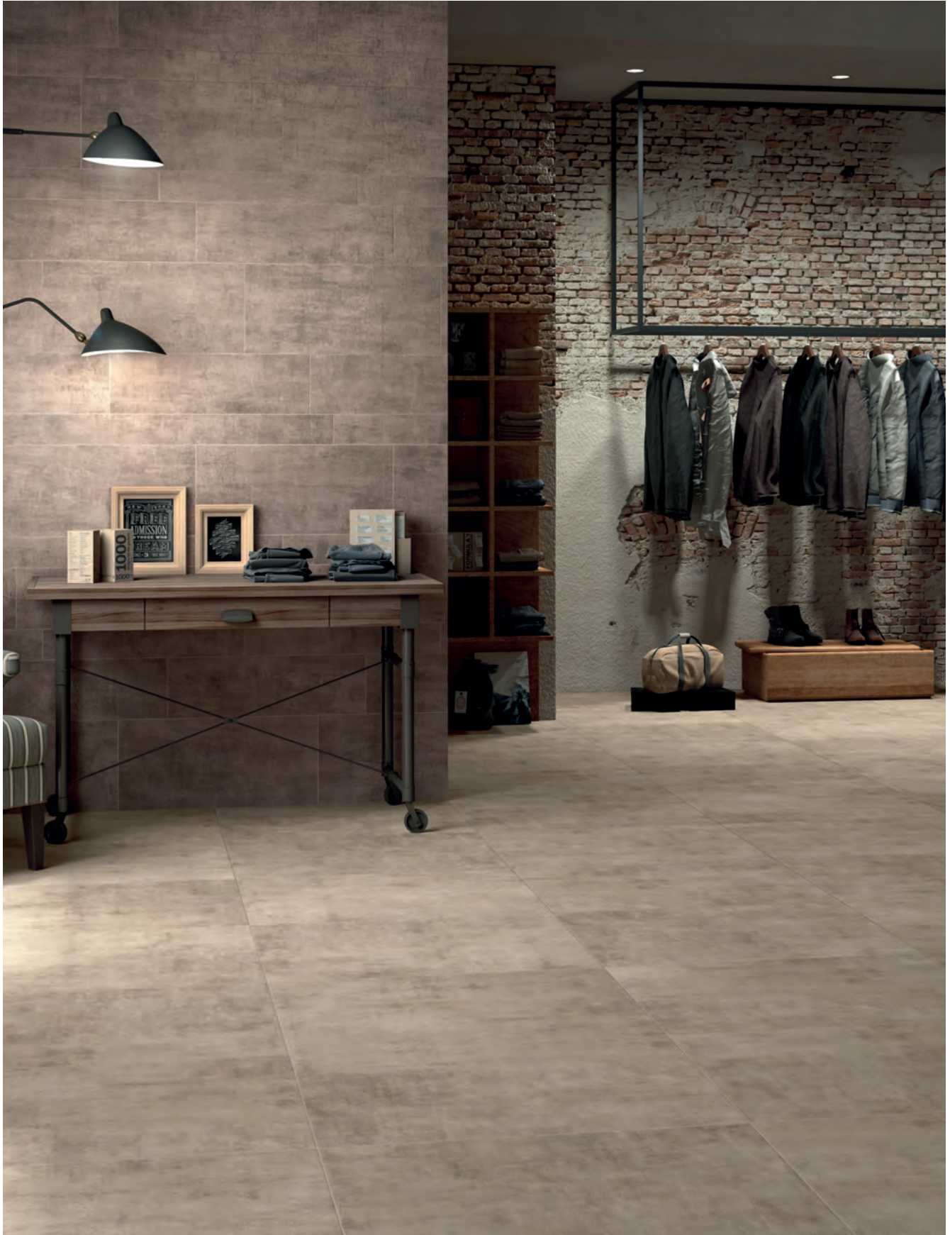
Product Featured: Fog Honed 12"x24"