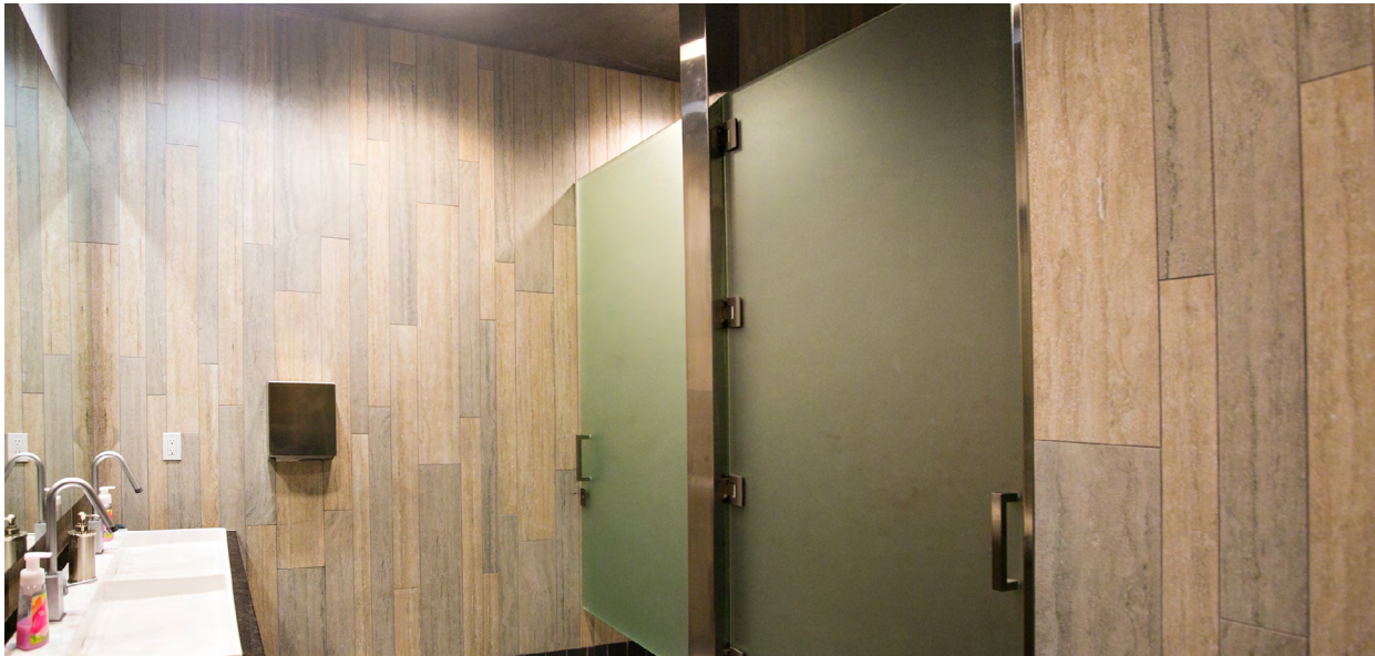
Product Featured: Argento Al Contro & Grigio Al Contro