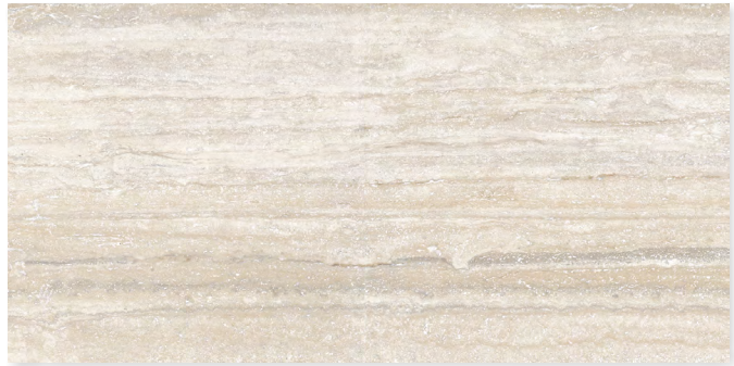
WIS11887 Bianco Al Controllo Honed 24" x 48"