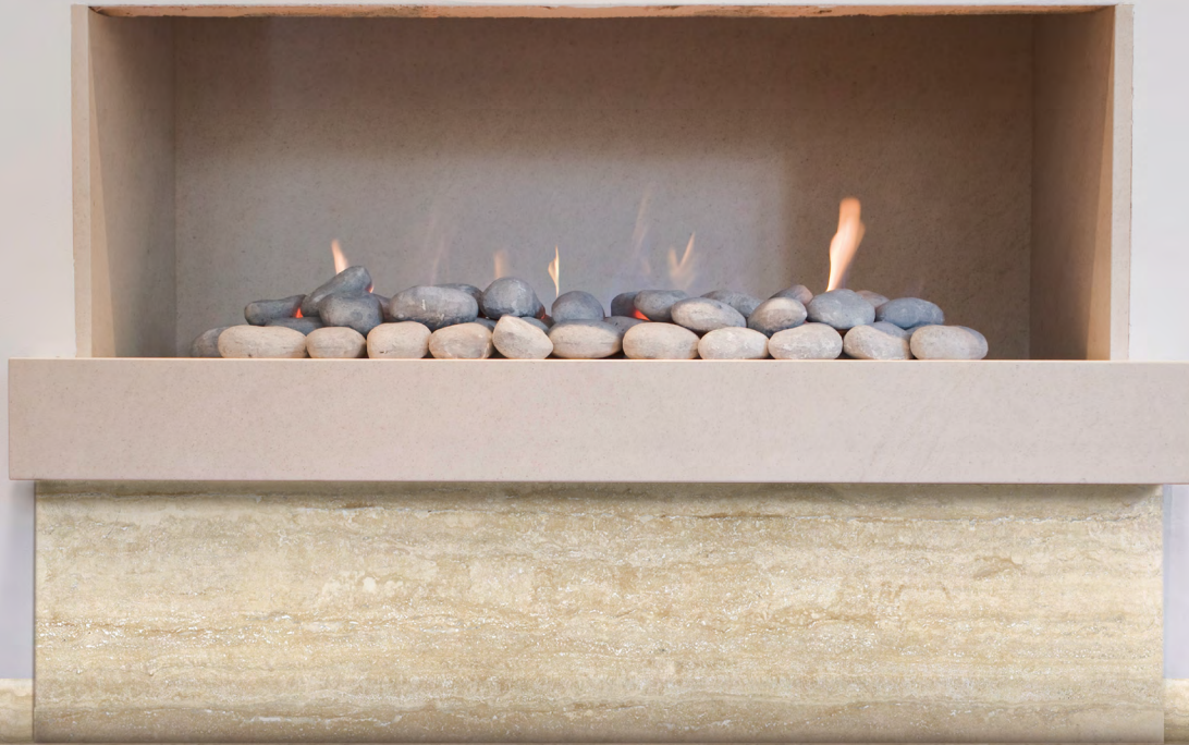
Product Featured: Argento Al Contro 24" x 48"