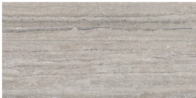
WIS11891 Bianco Al Contro Honed 24" x 48"