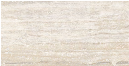
WIS11885 Bianco Al Controllo Honed 12" x 24"