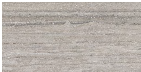
WIS11889 Grigio Al Contro Honed 12" x 24"