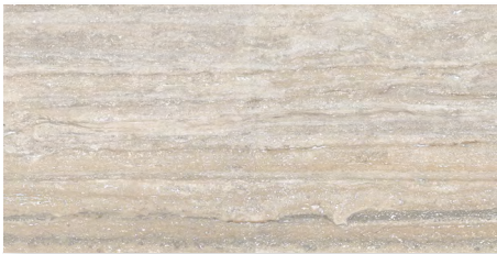
WIS11893 Argento Al Controllo Honed 12" x 24"