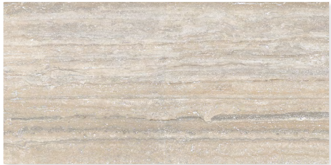
WIS11895 Argento Al Controllo Honed 24" x 48"